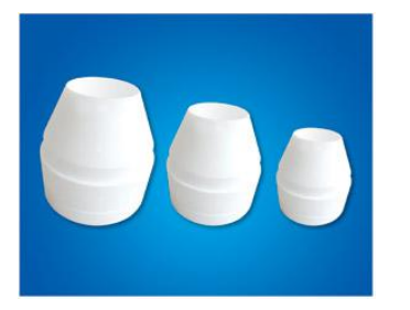
Item no.:PTFE Accessories For Printing And Dyeing Mechanical Equipments

Kaxite is one of the leading China PTFE Accessories For Printing And Dyeing Mechanical Equipments suppliers and manufacturers, and with productive factory, welcome to wholesale PTFE Accessories For Printing And Dyeing Mechanical Equipments products from us.